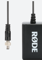
DC Power Pack